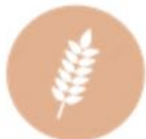
Cereals containing gluten